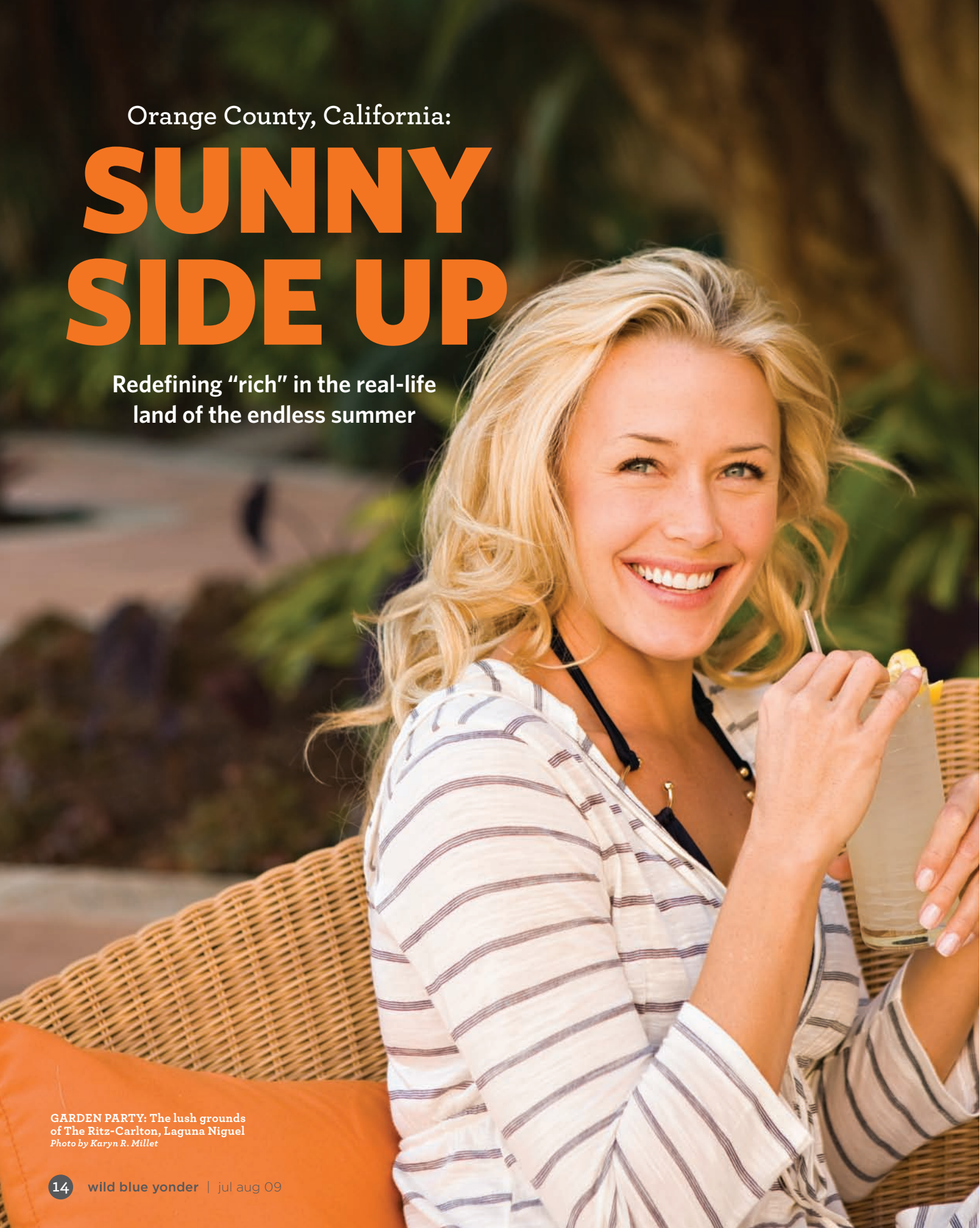
GARDEN PARTY: The lush grounds of The Ritz-Carlton, Laguna Niguel

Redefining "rich" in the real-life land of the endless summer