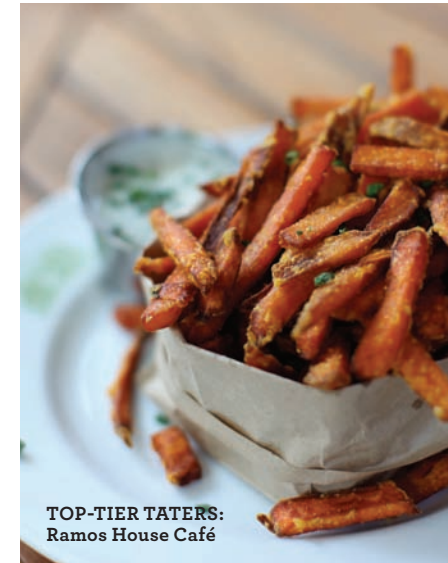
TOP-TIER TATERS: Ramos House Café