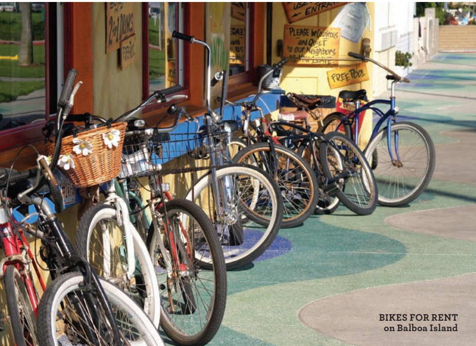
BIKES FOR RENT on Balboa Island