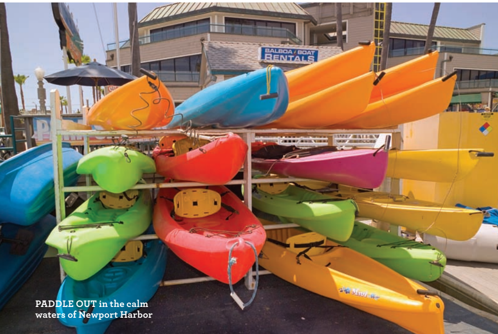
PADDLE OUT in the calm waters of Newport Harbor

the Beachcomber Café, an exploration of the tide pools, a snorkeling tour of the 1,140-acre underwater park—or simply a stroll along the shimmering coastline.