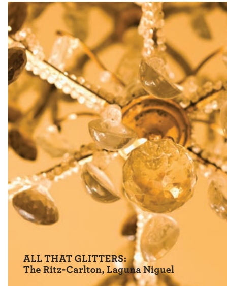
ALL THAT GLITTERS: The Ritz-Carlton, Laguna Niguel